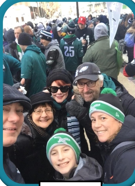
Eagles Parade 2/8/18